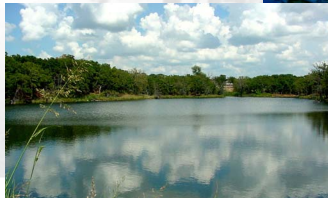
Southwest Nature Preserve Dam Safety Evaluation, Arlington