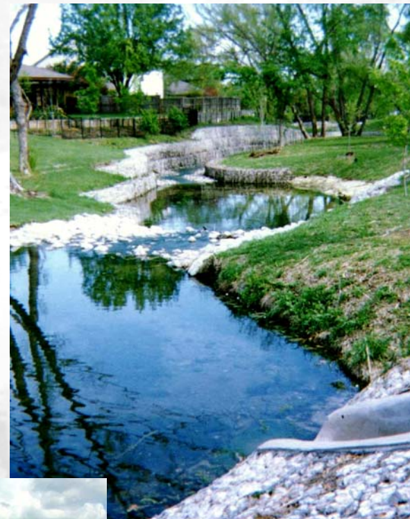
Pittman Creek Erosion Control, Plano