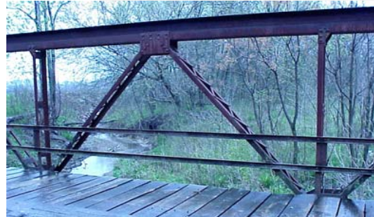
Stacy Road, LOMR, Allen