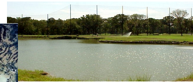
Vista Ridge Golf Center, CDC, LOMR, Lewisville