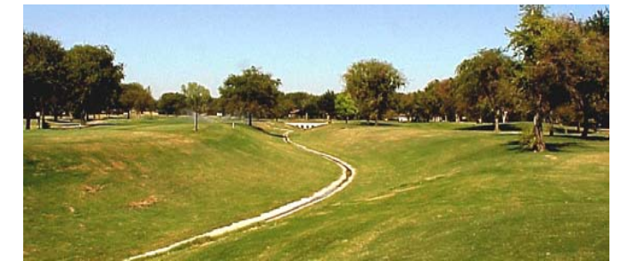
Tanglewood Drainage Remediation, Farmers Branch