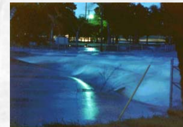
Flooding on Elm Fork